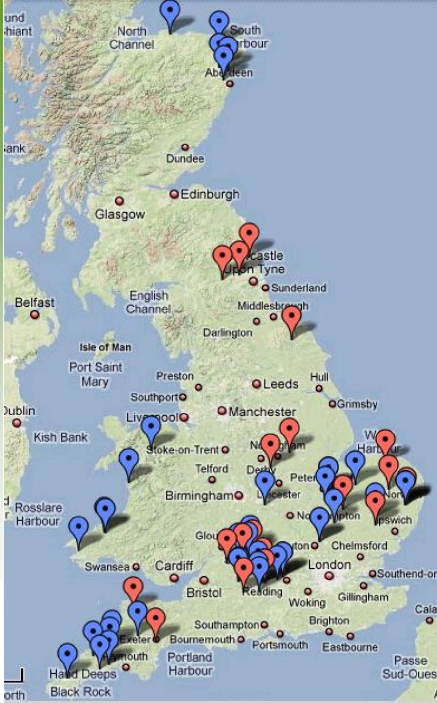
Map of participating farms in two ORC run LINK projects