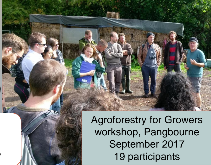
Agroforestry for Growers workshop, Pangbourne September 2017 19 participants