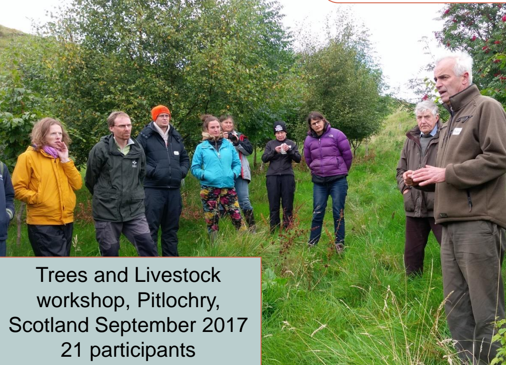
Trees and Livestock workshop, Pitlochry, Scotland September 2017 21 participants