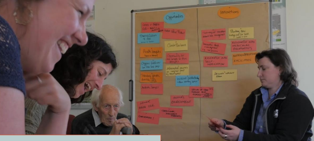
Tree Fodder workshop Elm Farm, Berkshire May 2017 23 participants